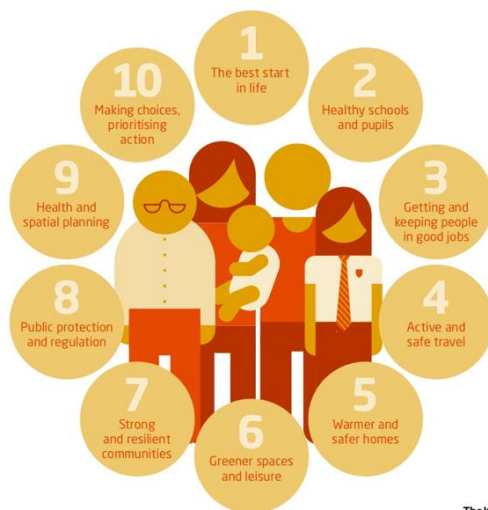
The King's Fund